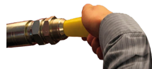
3. Push & Twist